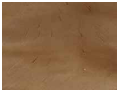
Café | 658