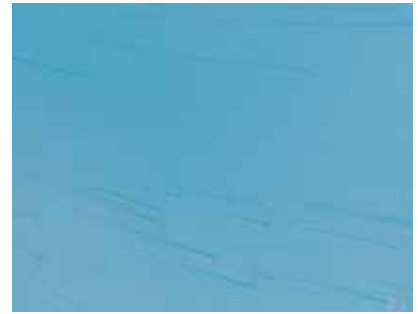
Topaz | 671