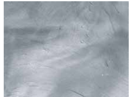
Silver | 661