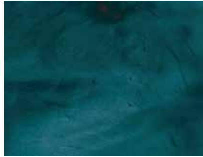
Sapphire | 662