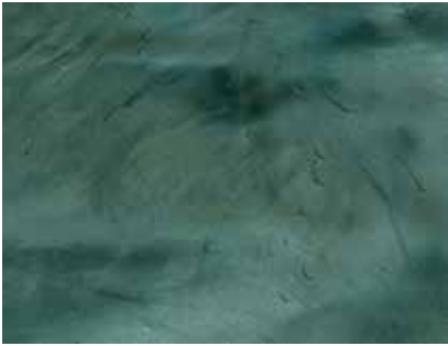
Marine | 655