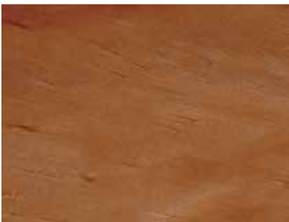
Sunset | 657