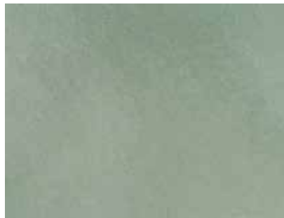
Sage | 669