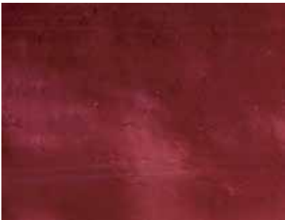
Ruby | 660