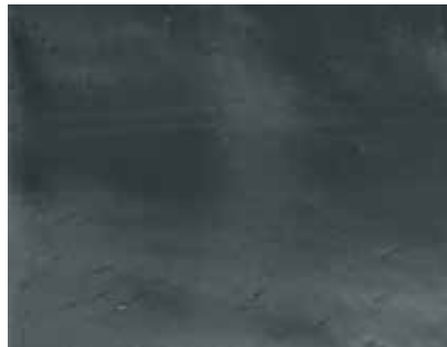
Graphite | 663