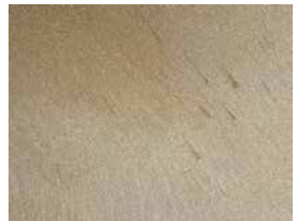
Taupe | 670